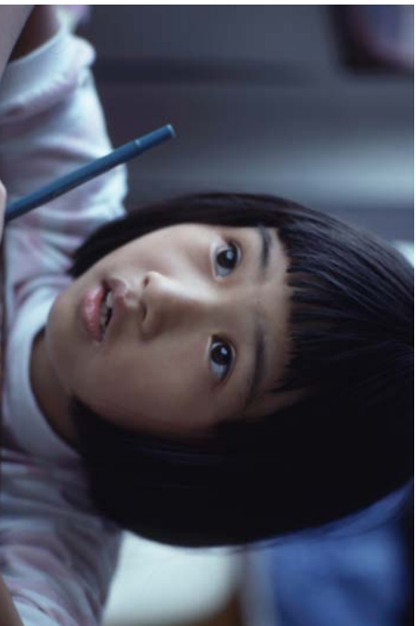
READY TO LEARN