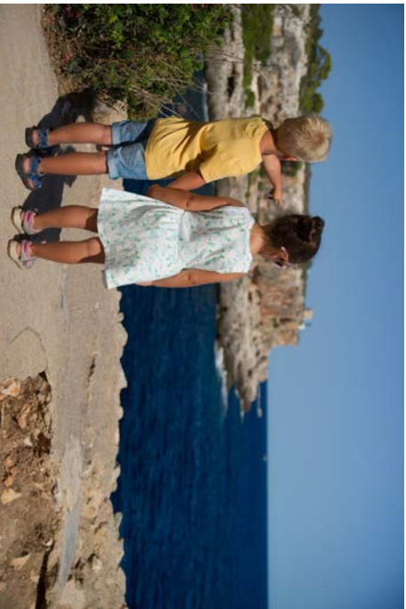
READY TO EXPLORE