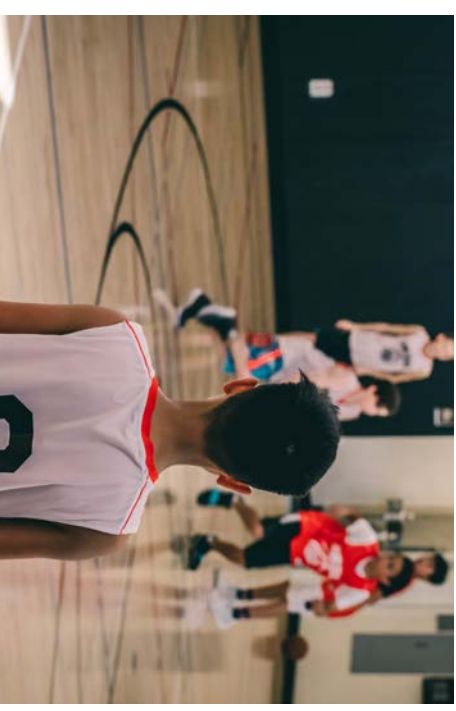
READY TO PLAY